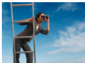
Scenarios link uncertainties with today’s decisions

In times of stability, planning and budgeting is a very rational approach to facilitating strategy implementation and resource management. However, when the economic environment is volatile, uncertainties about the future tend to paralyse any rational planning process. One approach to link uncertainties